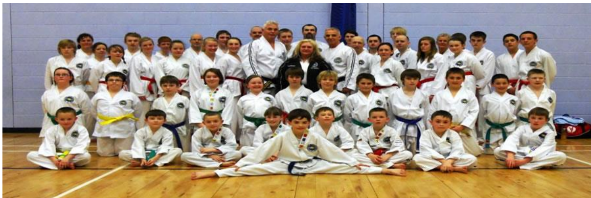
Three Masters Seminar Inverness, March 2012

The UKTF intend to repeat this seminar in 2013 at either end of the country. Dates and venues to be confirmed.