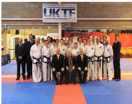
Livingston, March 2014

The UKTF Masters meet twice a year to teach individuals who attend the national black belt promotions. Congratulations to all those who were successful and promoted within the black belt ranks. With the promotion to black belt comes the responsibility of leading by example. It is the duty of every black belt to support firstly your gym and instructor and attend all events to enhance your knowledge and attend every technical seminar for self improvement. A black belt is not something you wear, it is something you become .