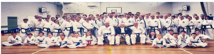
Inverness, September 2014