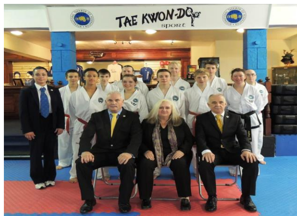
Inverness, September 2014