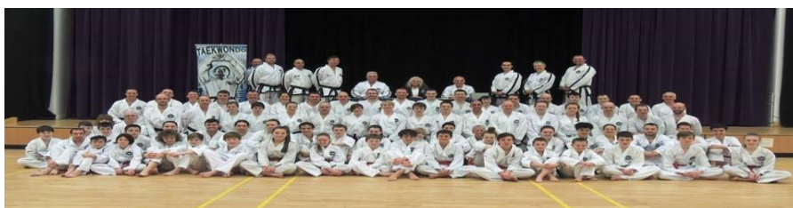
Armadale March 2014

Closing date for applications 14 th of March 2015.